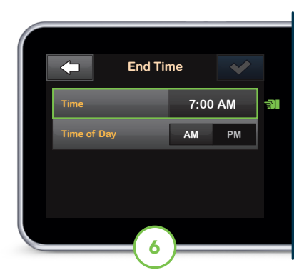
Repeat the same process to configure the End Time .

▶ Note: These times should reflect the time the user generally goes to sleep and wakes up. If applicable, also confirm the time of day is accurate.