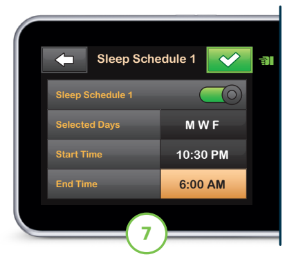
Tap to save the settings.

▶ Note: These times should reflect the time the user generally goes to sleep and wakes up. If applicable, also confirm the time of day is accurate.