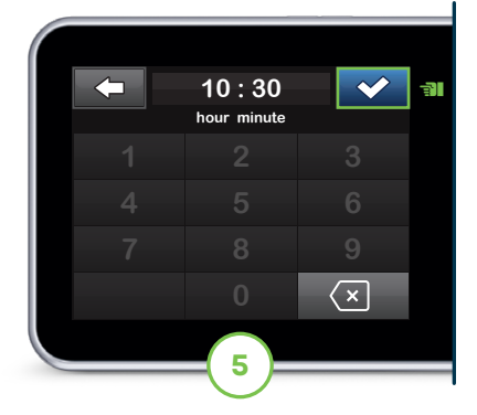
Tap Start Time and then tap Time . Use the keypad to enter the desired time. Tap to continue and then tap again.