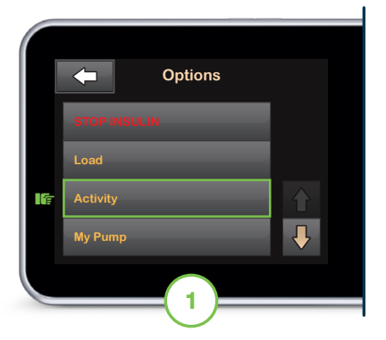
From the Home screen, tap OPTIONS and then Activity .

Users can program their t:slim X2 insulin pump to automatically switch into the Sleep Activity. Two Sleep Schedules can be used.