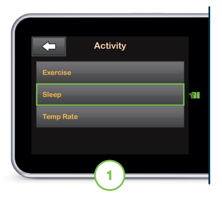
From the Home screen, tap OPTIONS and then Activity . Tap Sleep .

Flip to the back to learn how the Sleep Activity adjusts insulin delivery when enabled.