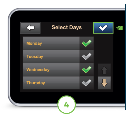
Tap Selected Days and then tap each day of the week the user wants Sleep scheduled. Tap to continue.

Pump Tip: Control-IQ technology must be on and continuous glucose monitoring (CGM)* session must be active on the pump to start the Sleep Activity.