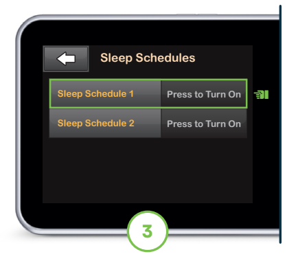
Tap Sleep Schedules and then tap a Sleep Schedule.

Note: Activities may not be enabled at the same time. If programmed, Sleep Schedule(s) will automatically start once Exercise is disabled.