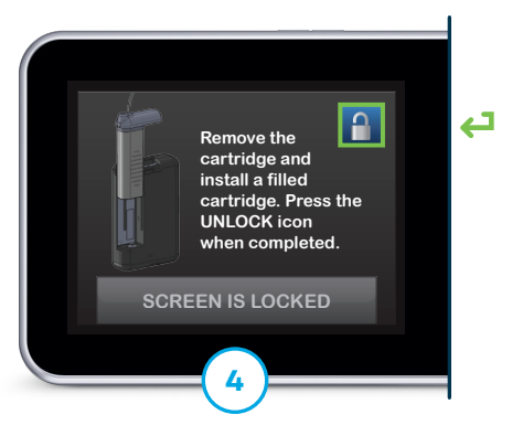
Install the newly filled cartridge and tap the unlock icon. Tap to continue.