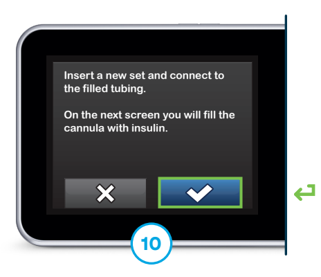
Reconnect tubing to existing or newly inserted infusion set. Tap to continue.