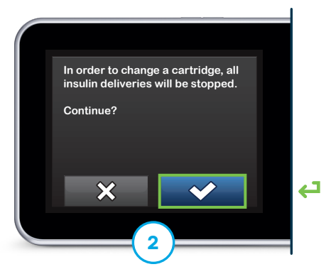
Tap ____ to stop insulin delivery.