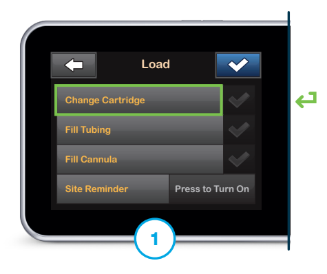
From the Home screen, tap OPTIONS, Load, and then Change Cartridge.