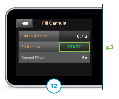
Tap START to fill cannula.