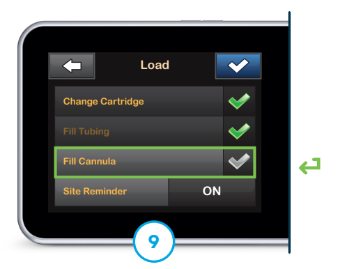
Tap DONE to confirm. If needed, tap Fill Cannula . Otherwise, skip to Step 13.