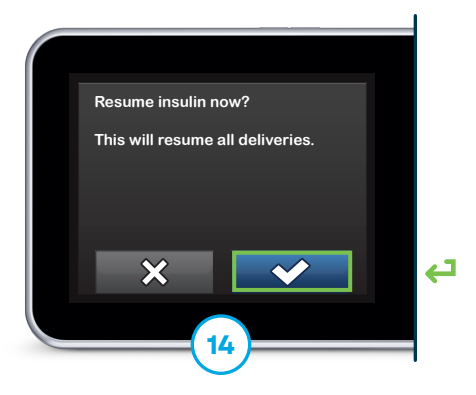
Tap to continue and then again to resume insulin delivery.