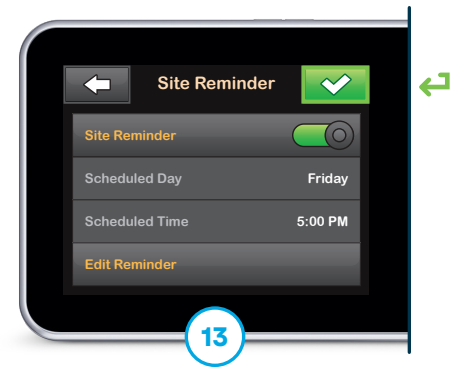
If desired, tap Site Reminder. Tap to save or tap Edit Reminder to make changes. Otherwise, skip to next step.