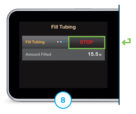
Tap STOP after three drops of insulin are seen at the end of the set.