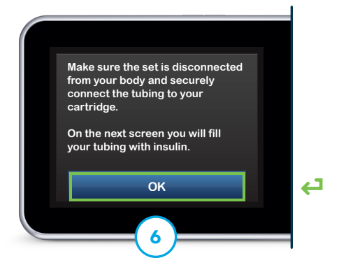
Tap ok to confirm the infusion set is disconnected.