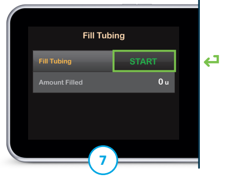
Hold the pump and tubing vertically and then tap START.