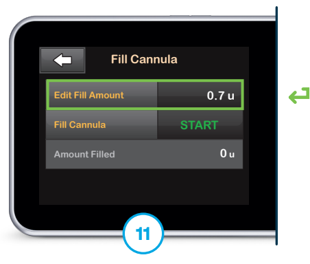
If needed, tap Edit Fill Amount and make selection. Otherwise, skip to next step.