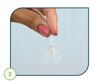
With the needle pointing down, fill the tubing until you see insulin drop from the needle.

▲ Caution: DO NOT fill tubing while the infusion set is connected to your body.