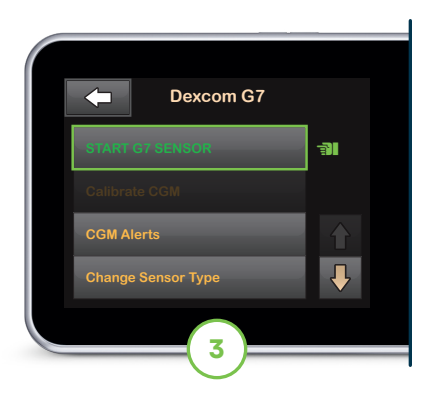
Tap START G7 SENSOR.

■ Note: If the user utilizes the Dexcom G7 mobile app, the user must start a sensor session and enter the pairing code on both the Dexcom G7 mobile app and t:slim X2 insulin pump.