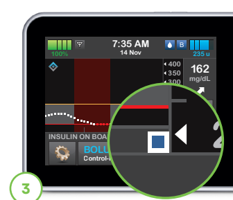
Control-IQ Technology Automatic Correction Bolus