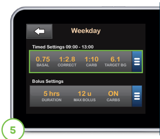
5 Tap the current settings to see the full list of timed settings for the entire day.