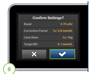
8 Confirm settings. Recent changes appear in orange. Tap to confirm.

Important Safety Information: Tandem insulin pumps are intended for the subcutaneous delivery of insulin, at set and variable rates, for the management of diabetes mellitus in persons requiring insulin. The t:slim X2 insulin pump is approved for individuals 6 years of age and older. For Important Safety Information, please visit tandemdiabetes.com/safetyinfo .