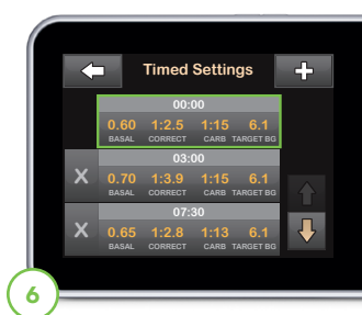
6 Tap the time segment the user wishes to edit. If not all segments are visible, tap the Down Arrow .