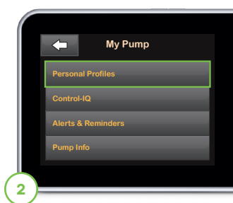
2 Tap Personal Profiles .