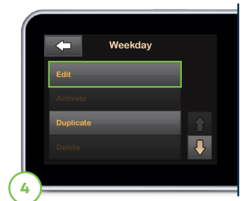
4 Tap Edit to edit or view the settings.