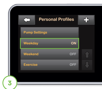
3 Tap the Personal Profile name to view or edit.