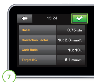
7 Tap Basal , Correction Factor , Carb Ratio , or Target BG to make changes, then tap . When finished, tap .